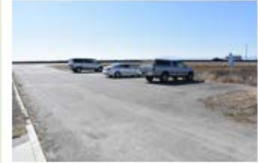
1 Cullinan Ranch • Amenities include: kayak and boat launch, observation area, and interpretive panels • Enhance Parking Lot & Portable Restroom