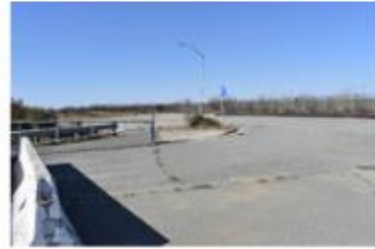
2 Guadacanal Village • Enhance observation area, parking lot, and interpretive panels • Improve bike/ped trail • Non-ADA compliant pedestrian stairs