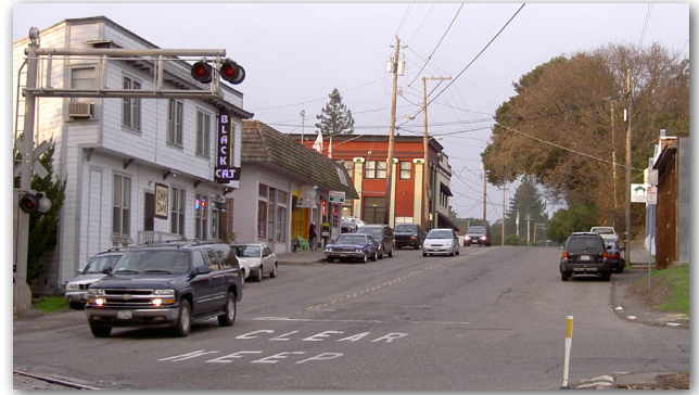
Old Redwood Highway in Penngrove

Environmental studies will begin in 2023.